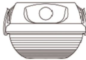
VTR 5.5" Nominal = 5.28" Width