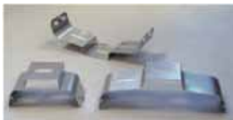
Standard Mounting Brackets