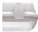
Standard Poly Latches