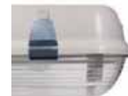
Optional Stainless Latches