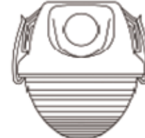
VTS 3.5" Nominal = 3.31"