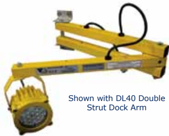
Shown with DL40 Double Strut Dock Arm

Our commitment is that any product that bears our name can be specified with confidence, knowing that we have taken the steps necessary to ensure maximum component life and future serviceability.