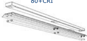
Wired CKU Assembly

After: F32T8/LP = 96 Watts 30,000 Hours, 90% Lumen Maint 80+CRI